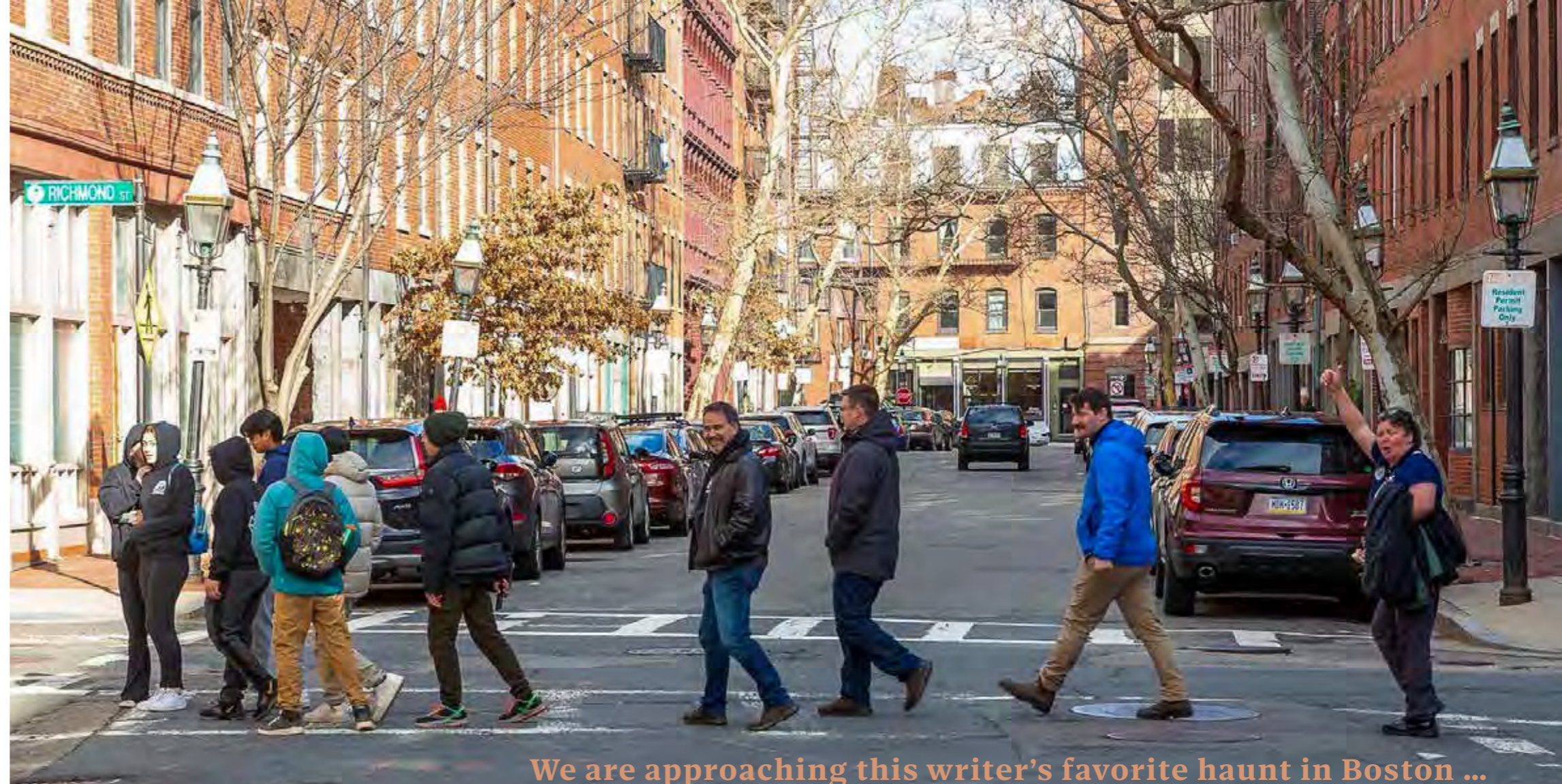
We are approaching this writer's favorite haunt in Boston ...