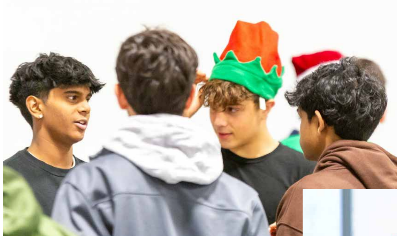
Chilling in preparation for a Goddard Tradition