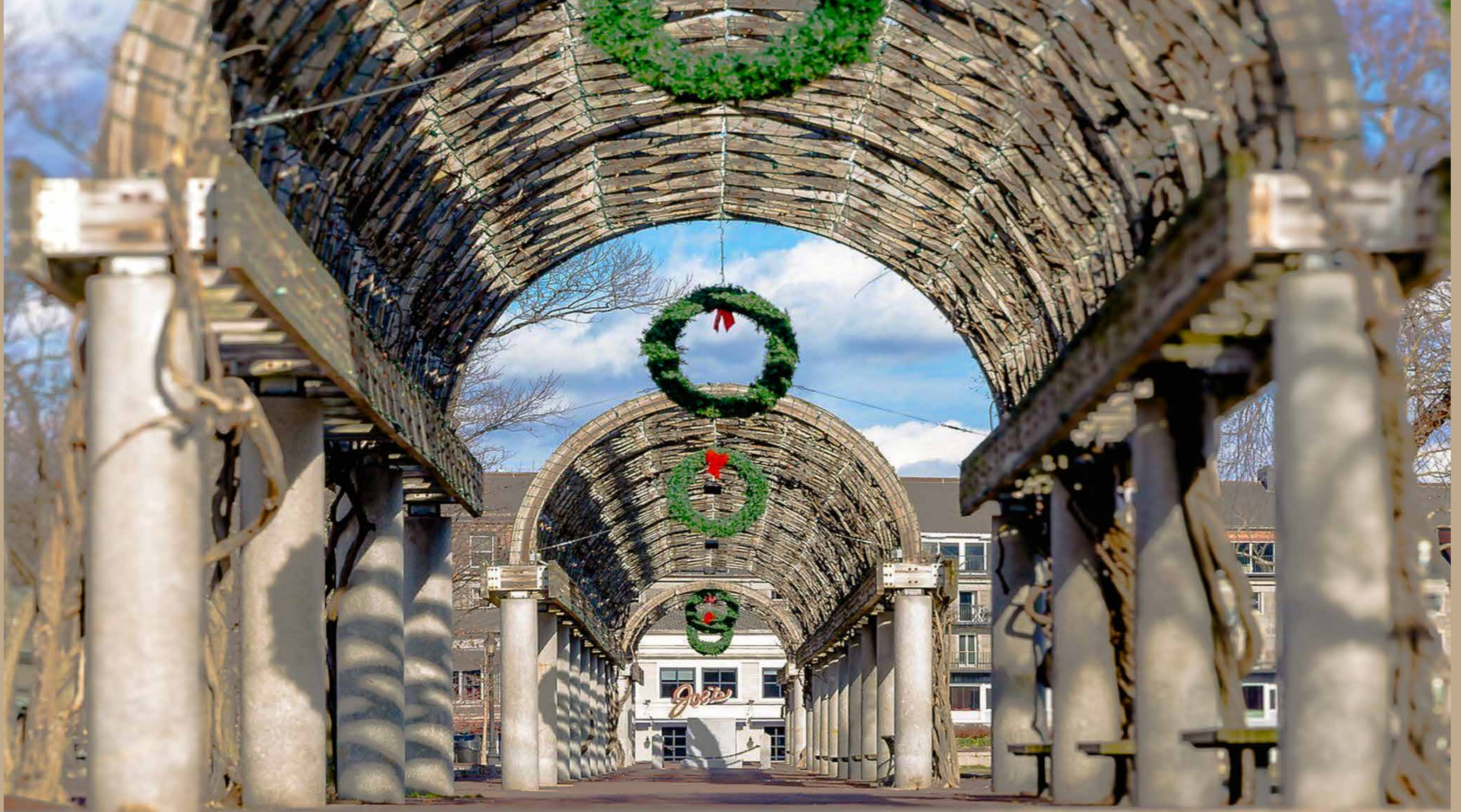
Christopher Columbus Waterfront Park: Welcome to Boston's North End!