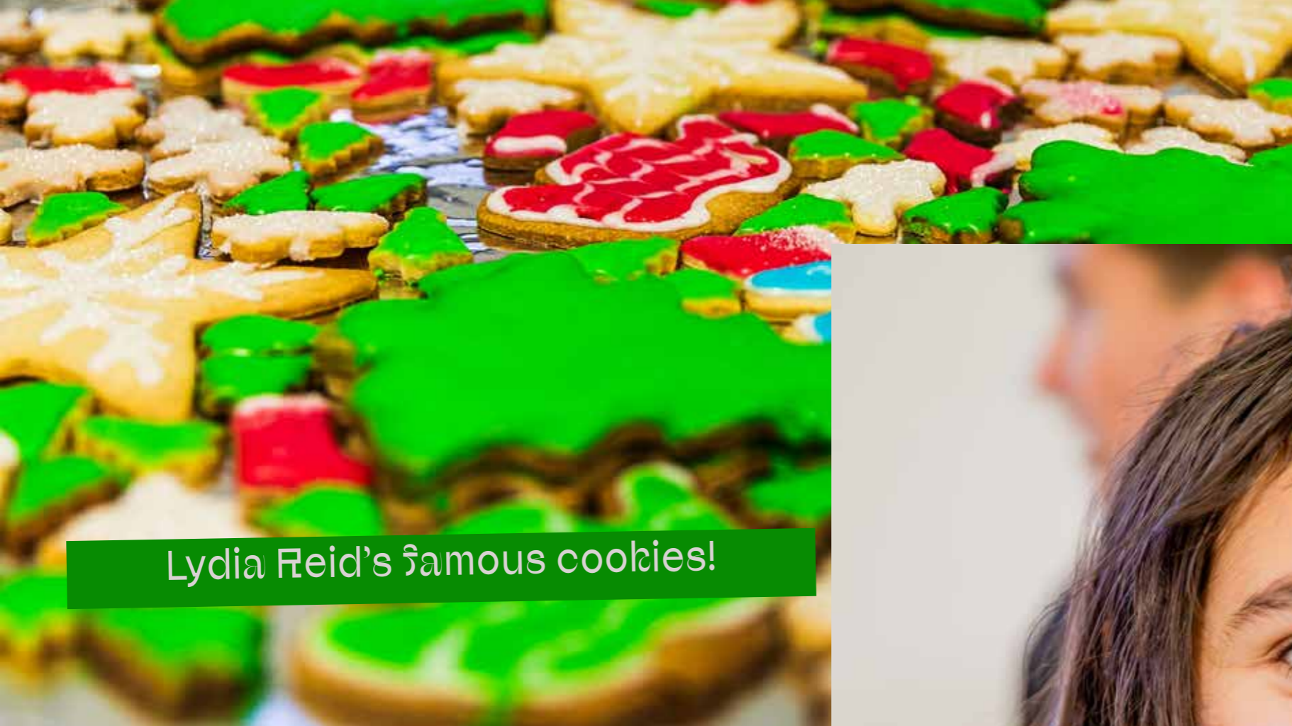
Lydia Reid's famous cookies!