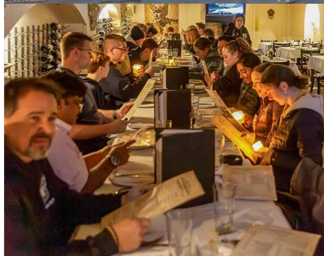
Fine dining at Trattoria il Panino in Boston's North End.