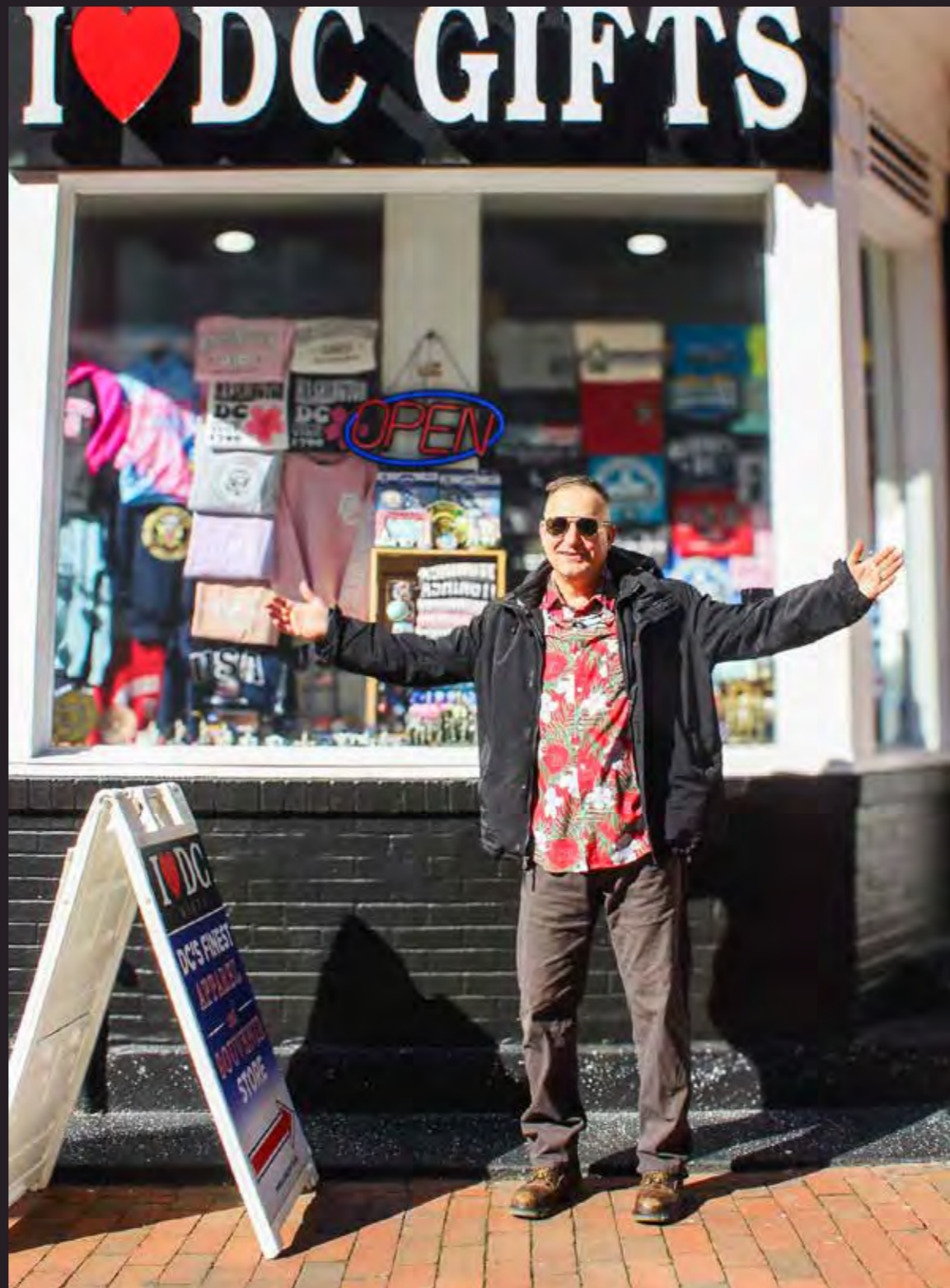
WHO IS THIS COLORFUL MAN?