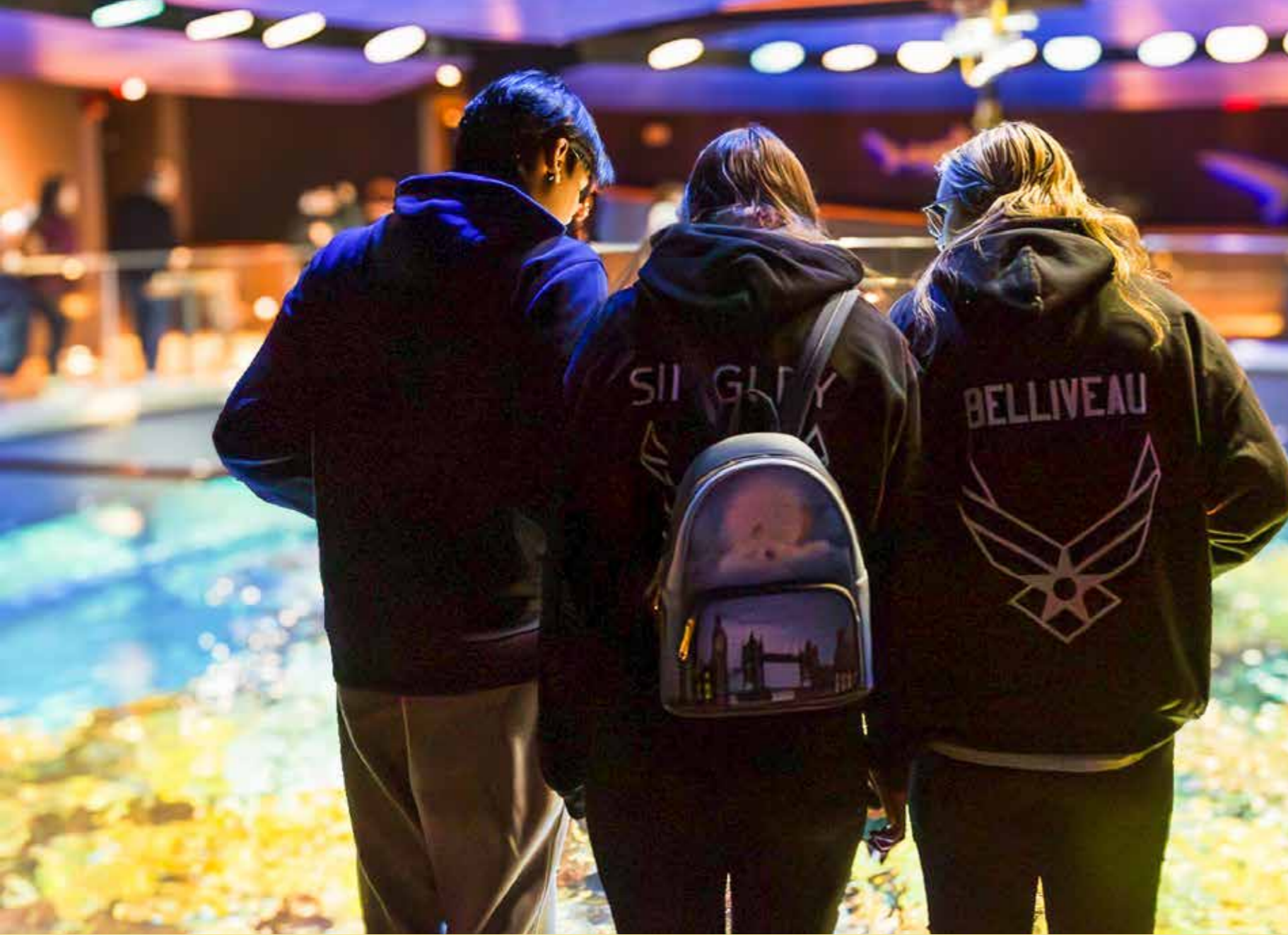
Cadets looking down from the top of the tank. This is my favorite viewing spot!