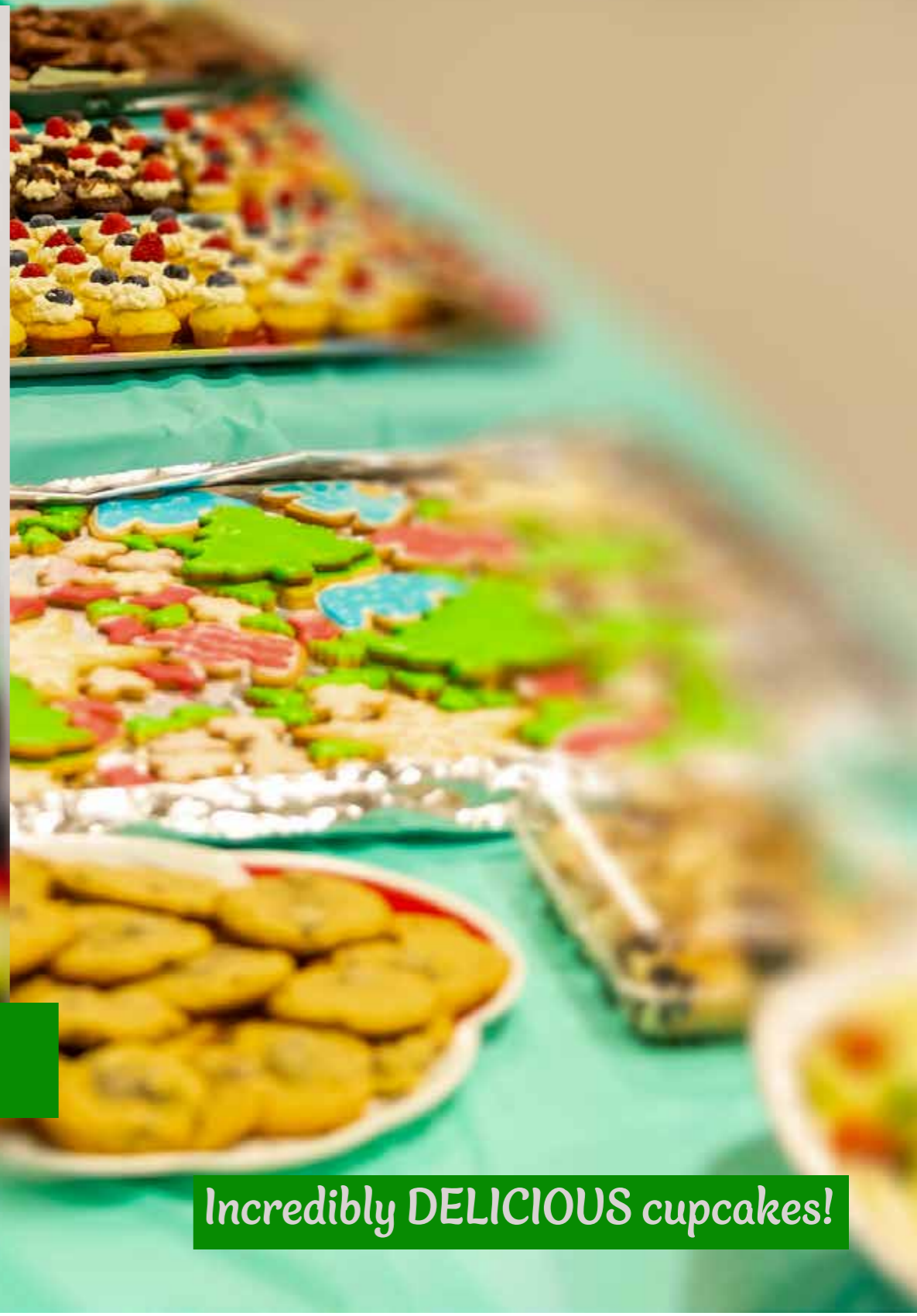
Incredibly DELICIOUS cupcakes!