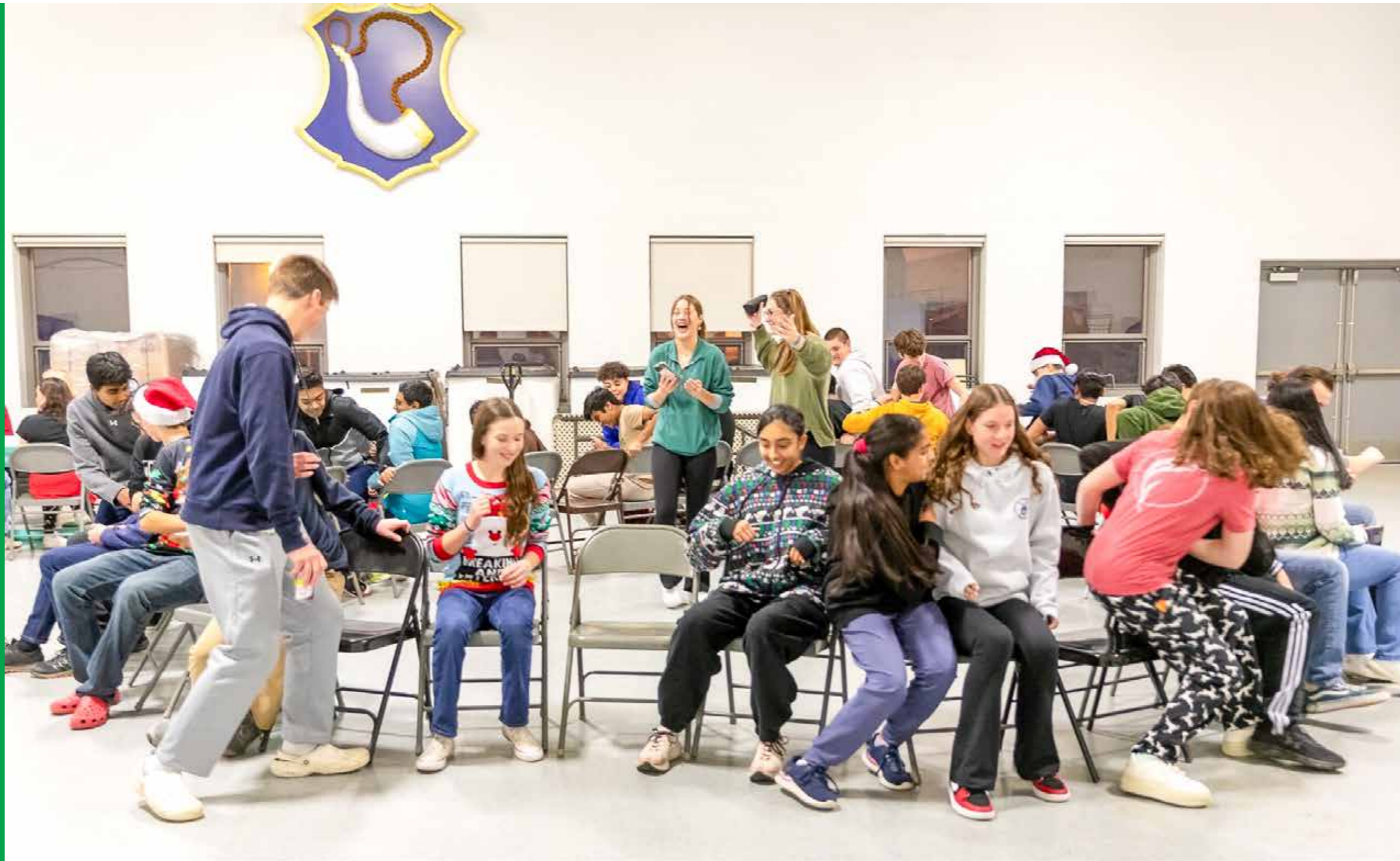
Yes, Musical Chairs is an annual Healthy Fitness Zone Activity at Goddard's holiday party!